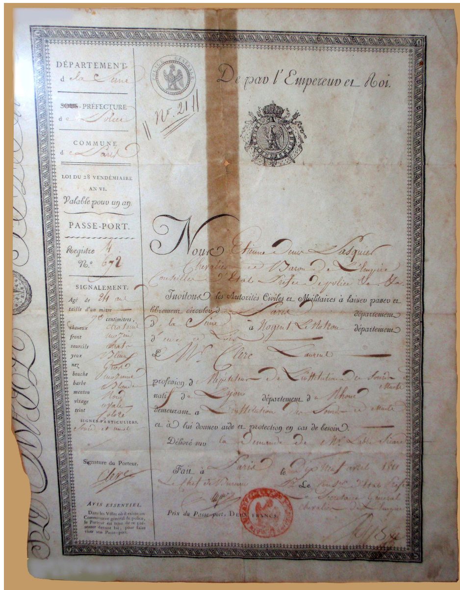
Laurent Clerc's French word "Passe-port" translated English word "Passport" Laurent's height was 5 feet and 11 inches. This passport is displayed in the Cogswell Heritage Museum.